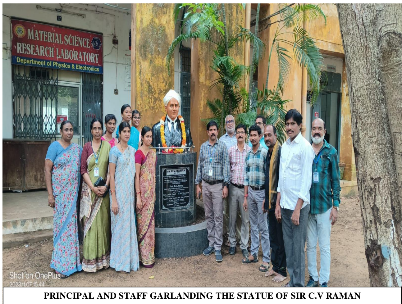
PRINCIPAL AND STAFF GARLANDING THE STATUE OF SIR C.V RAMAN

Two final year students spoke about the biography of Sir C.V.Raman.